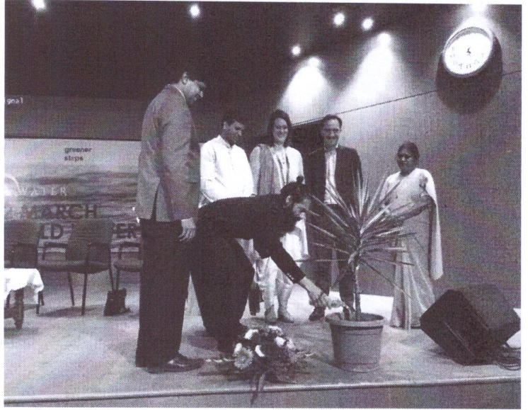
At the inaugural function lighting the Kuthu Vilakku(lamp) was replaced by watering the pottery plant.

Set under the theme 'Nature for Water', this year explores nature-based solutions to the water challenges we face in the 21 st century. The conference joined the global community of people who strive to make a difference and is officially registered under the UN World Water Day.