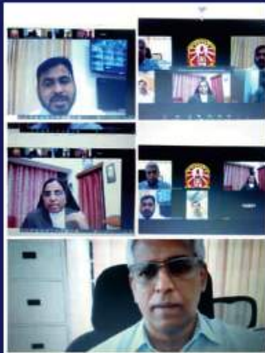
Tamil Nadu Regional Meet - Feb 10, 2022 at 04:30pm