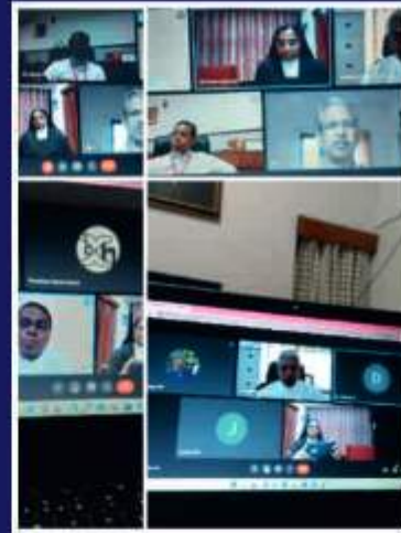
Kerala South Regional Meet - Feb 4, 2022 at 04:00pm