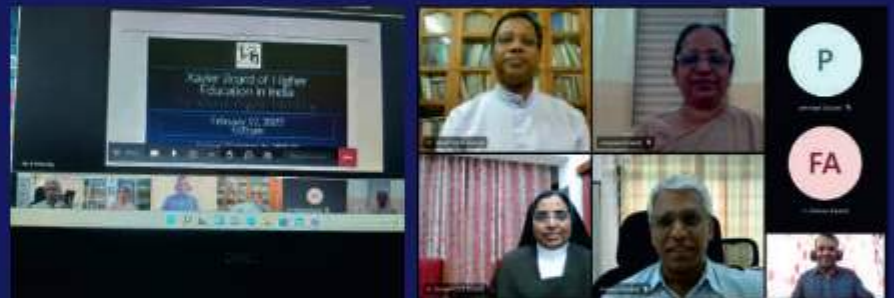
Karnataka Regional Meet - Feb 12, 2022 at 05:00pm