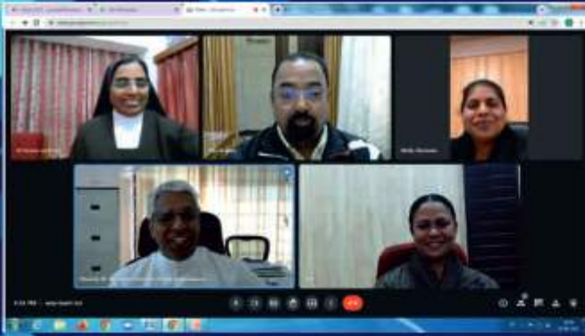
Northern Regional Meet - Feb 17, 2022