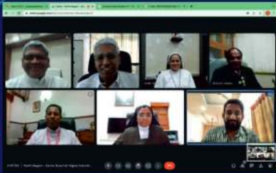
Kerala North Regional Meet - Jan 27, 2022 at 04:00pm