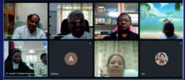
East and North East Regional Meet - March 10, 2022