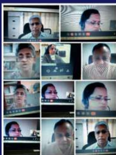
Western Regional Meet- Feb 12, 2022