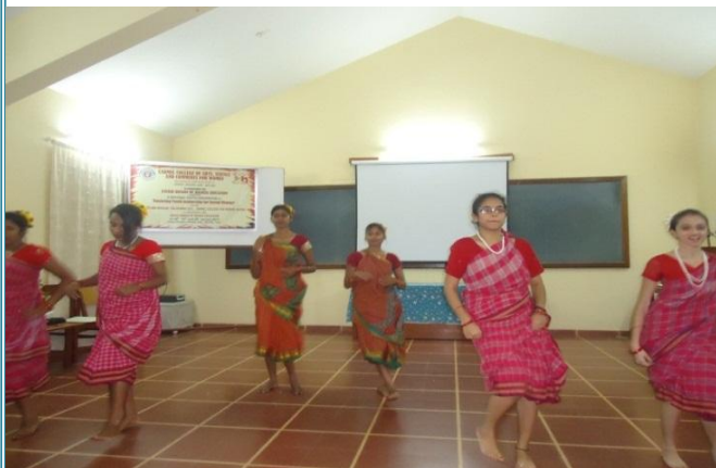
A dance depicting Goan Culture

Participants from different states also got an opportunity to display the culture of their own states through dance, acts and songs at the cultural programme during recreation time.