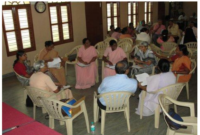
Participants involved in Group discussion