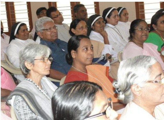
Participants in rapt attention