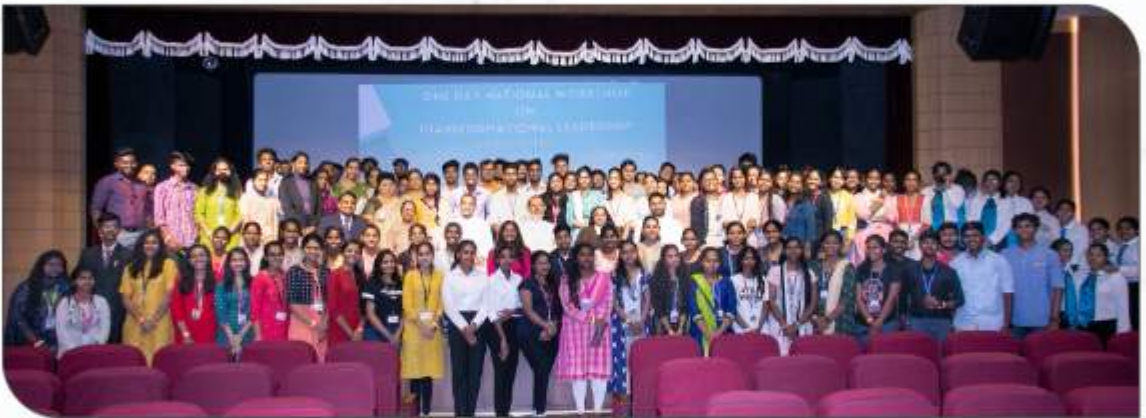
National Youth Program (Karnataka Region- April 8 th , 2022)