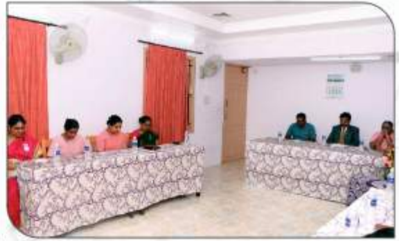
National Youth Parliament Xavier Board of Higher Education in India - Tamilnadu Region and Fatima College (Autonomous) on 7 th April 2022.